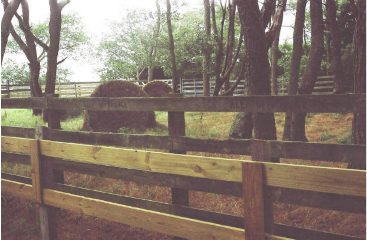
the pony pens are ready, the stock trailers lined up, as Pony Penning week begins