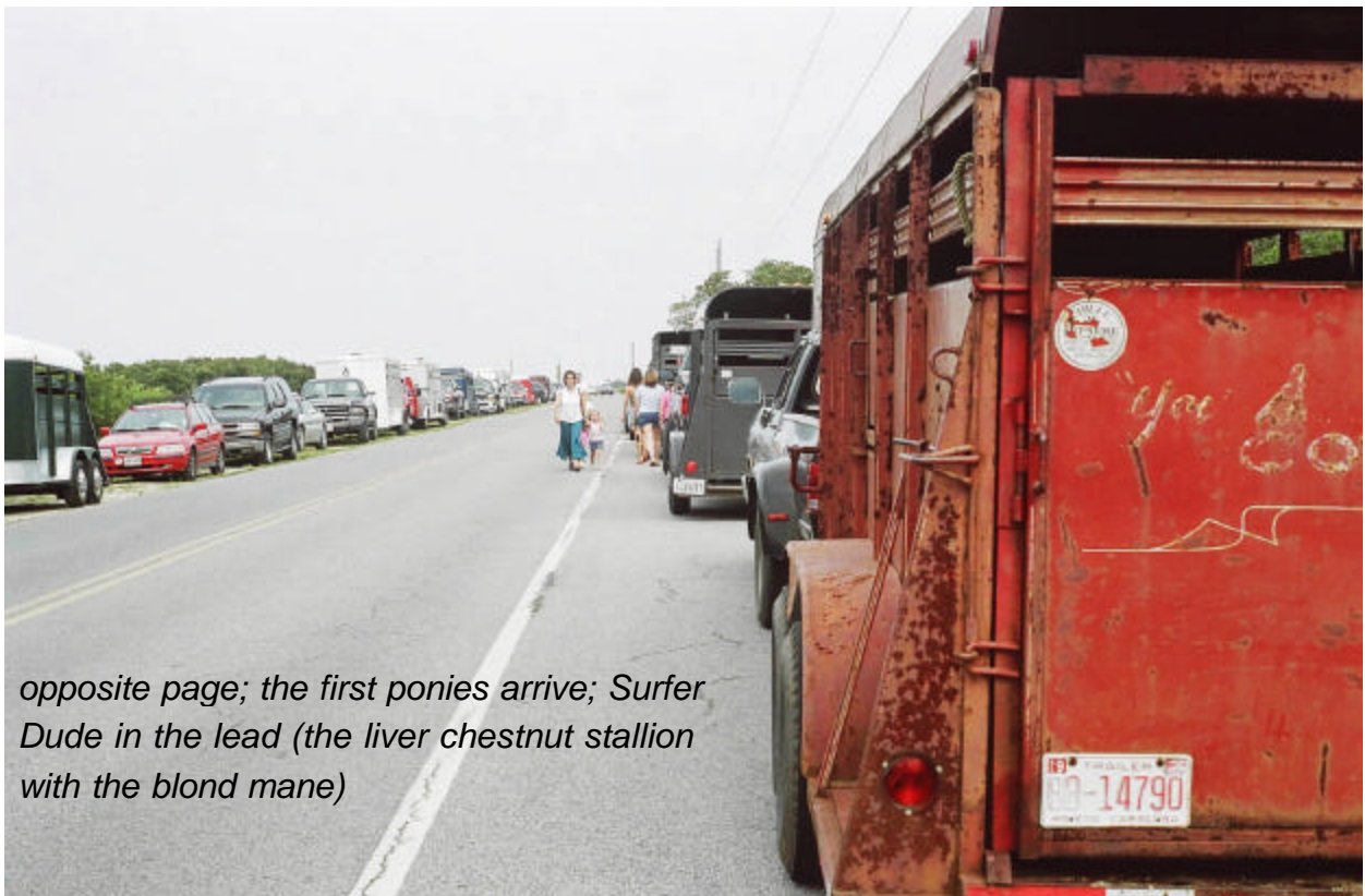
opposite page; the first ponies arrive; Surfer Dude in the lead (the liver chestnut stallion with the blond mane)