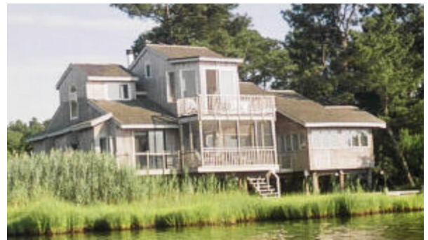
Fishing boat flying the jolly roger, dream houses on the channel, the drawbridge in operation; it creates quite the traffic jam on Main Street.