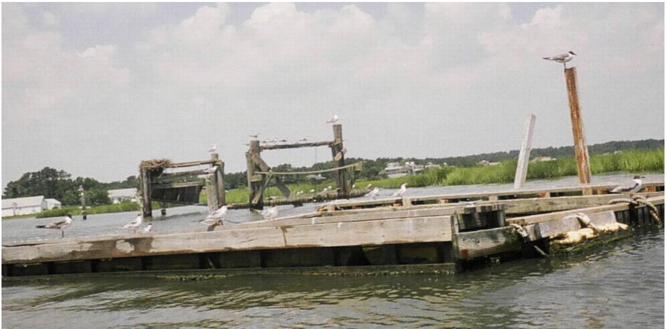
Tern central, and the vastness of open water in the back bays: Oyster Bay and Little Oyster Bay, on the Assateague side of Chincoteague. Shallow water ( two or three feet, except in the narrow channels) and high winds created some great waves here the first day.